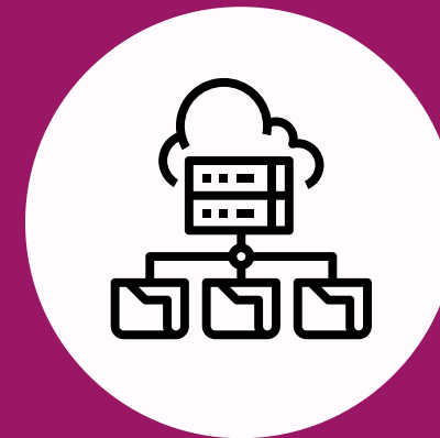
H&H DOCUMENT, DATA AND RECORDS MANAGEMENT